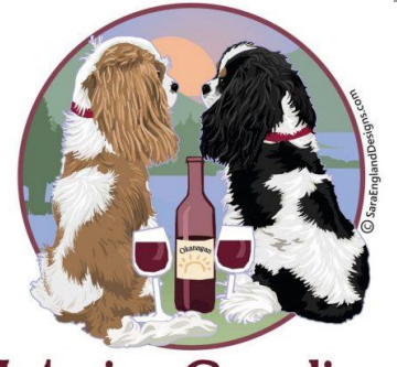
Interior Cavalier King Charles Spaniel Club

ENTRIES CLOSE: WEDNESDAY, June 22<sup>nd</sup>, 2022 @ 9:00pm Pacific Time