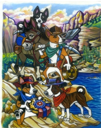
PANNING FOR POINTS!!