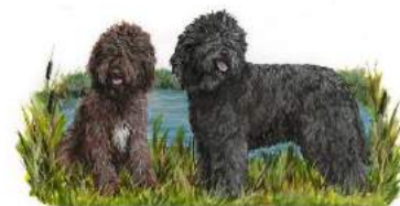
Club Barbet Canada - 2024 National Specialty

CONFORMATION - Regular & Non-Regular Classes